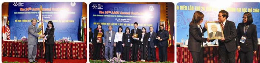
AAOU Secretariat at Universitas Terbuka, Indonesia 2008 - 2010