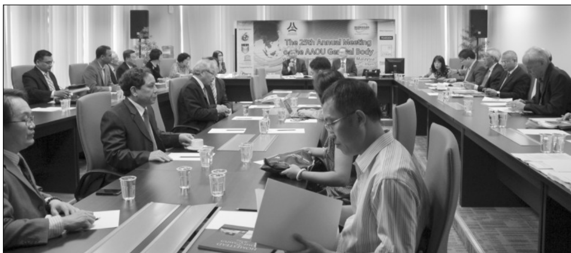
AAOU General Body Members