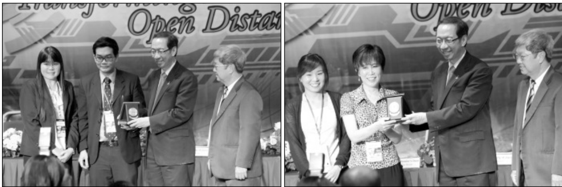
Recipients of BPA Silver Medal