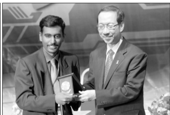
Recipients of YIA Silver Medal