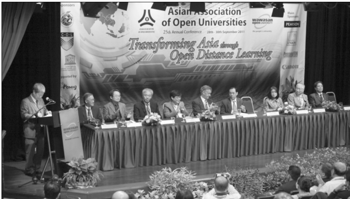
Opening Ceremony of the 25 th AAOU Annual Conference: Keynote and Plenary Speakers

The 25 th AAOU Annual Conference was successfully organised by WOU, Penang, Malaysia from 28 th to 30 th September, 2011 with the theme “ Transforming Asia through Open Distance Learning ”. The Conference brought together more than 270 international and local delegates comprising Vice Chancellors and Presidents, scholars, senior administrators and policy makers representing 68 Open Universities and other Open Distance Learning (ODL) institutions from 22 countries across Asia, Australia, Africa, Europe and America. The conference was officiated by the Honorable Minister of Higher Education for Malaysia who was represented by Prof. Dr. Morshidi Sirat, Deputy Director General of Public Higher Education Institute.