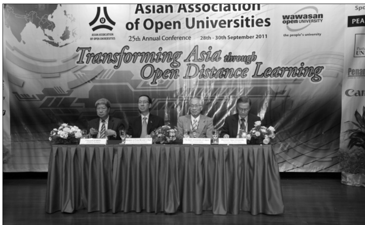
Closing Ceremony of the 25 th AAOU Annual Conference officiated by Hon. Senator Tan Sri Dr. Koh Tsu Koon, Minister in the Prime Minister’s Department

The Conference closing ceremony was officiated by the Hon. Senator Tan Sri Dr. Koh Tsu Koon, Minister in the Prime Minister’s Department, who was impressed by the immense contribution of ODL in the development of human capital in Asia.