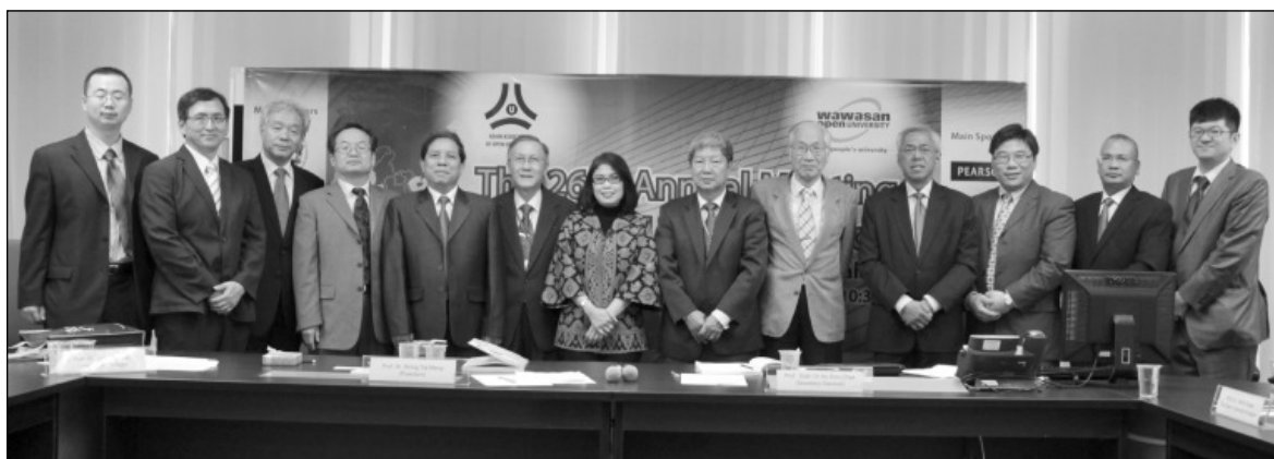
AAOU Executive Board Members

Minutes of the EB and GB meetings had been circulated via email to all the relevant members for their comments and feedback. Only some slight typographical errors were noted and changes had been incorporated accordingly. The revised minutes were then forwarded to all members for their retention.