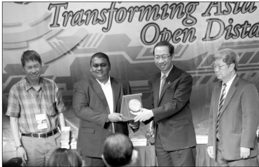
Recipients of BPA Gold Medal