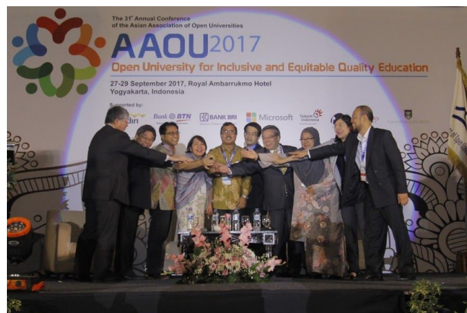
Members of the Asian MOOCs Steering Committee launch the AAOU Initiatives 2017.

Members of the AAOU Asian MOOCs Steering Committee, who are the initial movers of the AAOU OER Repository, and the heads of the institutions spearheading the World Languages MOOCs also came together onstage to officially launch the AAOU Initiatives, which are set to open in January 2018.