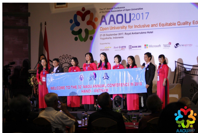
Delegates from the AAOU 2018 host institution Hanoi Open University promotes the upcoming annual conference.