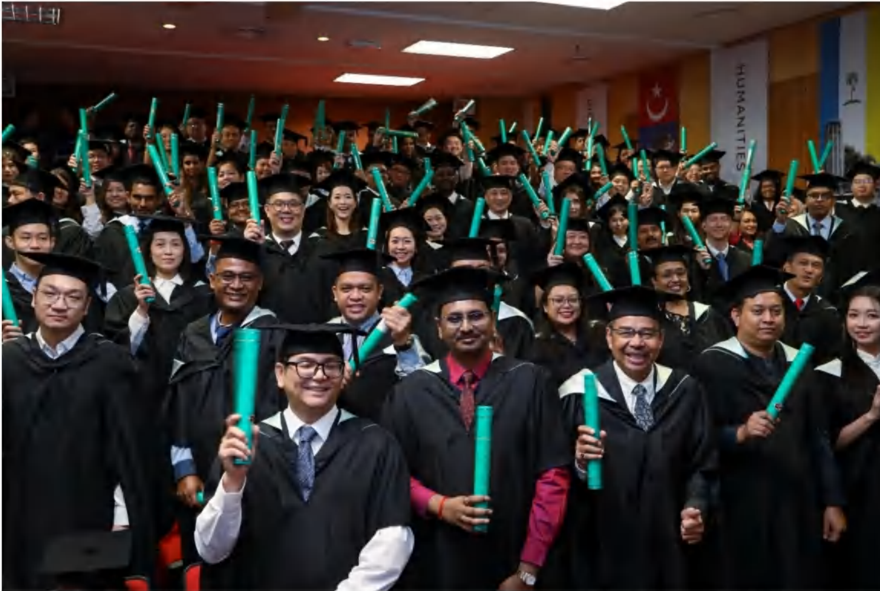
Every scroll, every lecture, every late night — all worth it for this moment